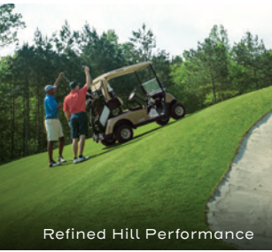
Refined Hill Performance