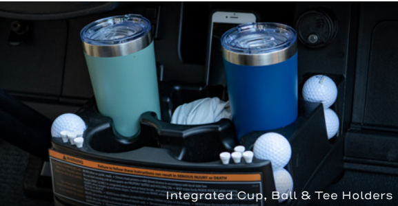
Integrated Cup, Ball & Tee Holders