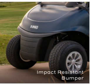
Impact Resistant Bumper