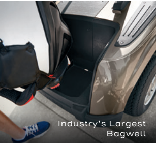
Industry's Largest Bagwell